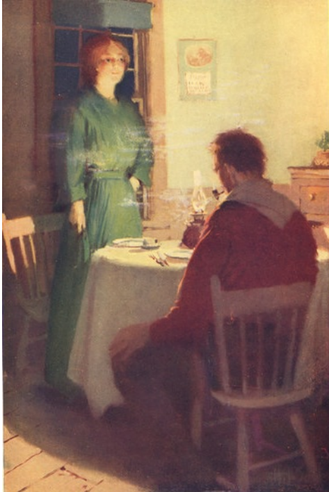
He sat glaring at the table, the smoke of his pipe clouding the still air of the neat kitchen.